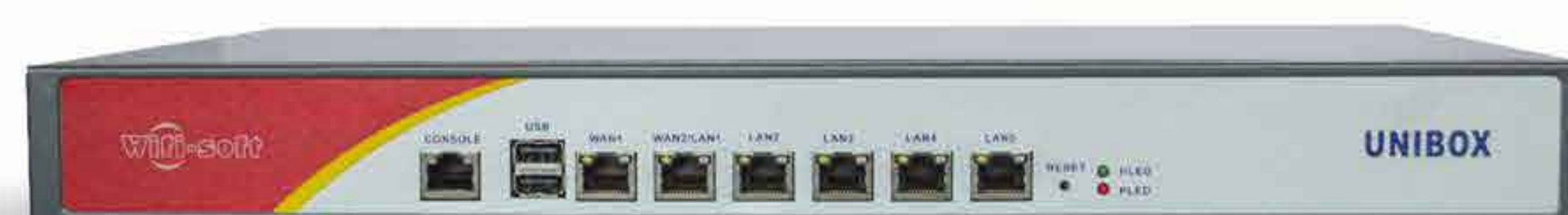
UniBox U2500 Network Controller

Prior to installing UniBox, student had unrestricted and uncontrolled Internet access thus resulting in unwanted downloads and congestions on the network. UniBox enforced per user bandwidth and speed restrictions which curtailed over-usage of bandwidth and enforced fair usage policy on each user. All students were allowed daily quota thus ensuring that bandwidth was utilized for legitimate purpose.